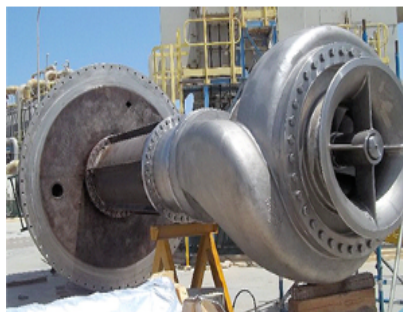
Upgrade hydraulic parts!

TSS offers a comprehensive range of on-site services such as installation, inspection, commissioning, removal, preventative and scheduled maintenance, emergency breakdown service, and full turnkey projects all designed to deliver optimum pump life-cycle results with minimum downtime. Our engineers and service technicians are highly trained and experienced, working to minimize unscheduled shutdowns for customers, while considering all factors associated with the pump duty conditions, age, and demands on the pump system.